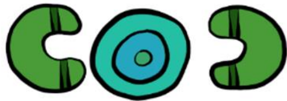
Two people sitting