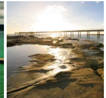
Image captions here.