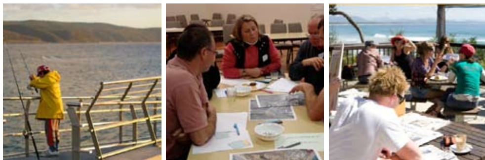
Image captions here.

Making Point Grey a point of difference for the area