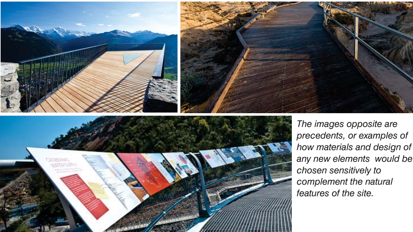
The images opposite are precedents, or examples of how materials and design of any new elements would be chosen sensitively to complement the natural features of the site.

Whilst historical and interpretive signs and monuments including the Diggers Memorial statue and the Great Ocean Road bronze plaque would be retained at the Arch, it would be important to provide options for information, history and significance of the Arch to those tourists who may no longer access the site directly.