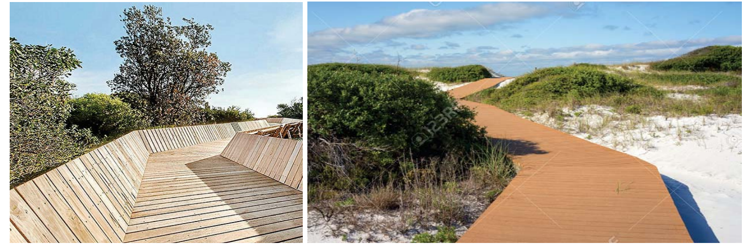
The above images are precedents, or examples of how materials and design of any new elements would be chosen sensitively to complement the natural features of the site.

Historical and interpretive signs and monuments including the Diggers Memorial statue and Great Ocean Road bronze plaque would be retained and re-configured at the Arch, as per the 'Snap Shot' scenario.