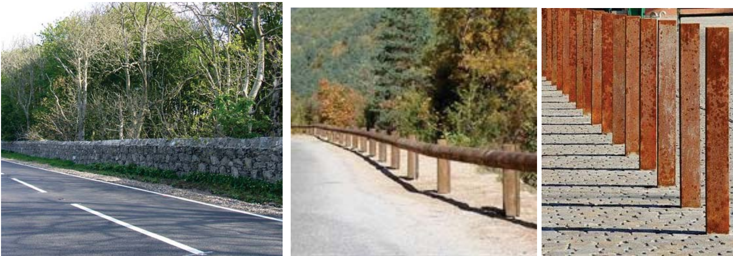
The above images are precedents, or examples of how materials and design of any new elements would be chosen sensitively to complement the natural features of the site.

Appropriate off-site locations for the existing historical and interpretive signs and monuments including the Diggers memorial statue and Great Ocean Road bronze plaque would be selected. Existing key attractions (3.1), Visitor Information centres (3.2) where there is a more aggregated historical narrative may be logical options. Digital technology such as app or radio based audio may be considered that provides an ‘in car’ description of the history and significance of the Arch.